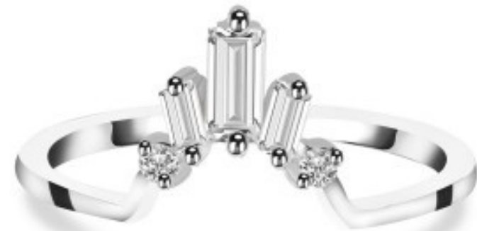
Cubic Zirconia Jewelry